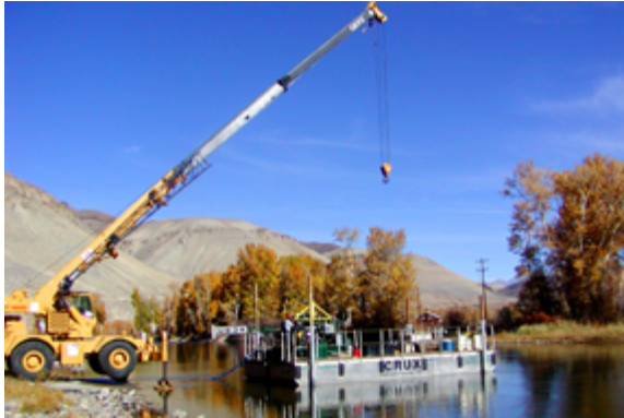
Performing geotechnical exploration work utilizing a Crux-owned specialty barge