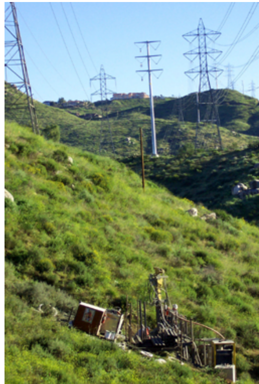
Installing micropile foundations for the environmentally-sensitive Miguel-Mission transmission line in Southern California

He says that the wind farms—at least in California—are often located in steep canyon regions, while the solar-based technology is grounded on desert floors that are separated from large metropolitan areas by mountain ranges. Crux has its own Spokane-based five-person engineering team that designs transmission tower foundation systems to adapt to the load and geotechnical conditions, Salisbury says.