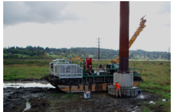
Completing micropile foundation work for 230 kV transmission line crossing Ebey Slough

“It helps avoid expensive change-order issues that can be encountered in difficult environments,” Tunison says. “We acquire the data, the soil and rock profiles, and incorporate that in the bid contract.”