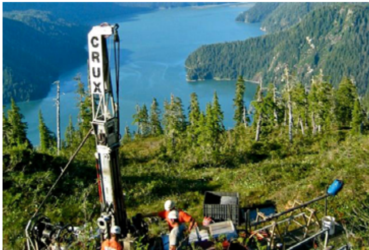
Micropile foundation installation for the Swan-Tyee Intertie in Alaska

Crux also added 14 new employees this past fall because of increased workloads, for a total 110 workers. The company says about 72 of those workers are Crux employees who are out in the field at job sites, while 38 are based at the company’s leased 20,000-square-foot building and 6-acre yard, at 16707 E. Euclid, and at a nearby leased 4,500-square-foot building.