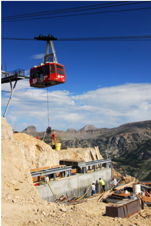
Micropile foundation construction for Jackson Hole Tram project

Some of its geotechnical drilling also is done with specialty drilling equipment loaded on barges, he says, including for a job undertaken for the Southern Nevada Water Authority to build a new water-supply tunnel farther out and deeper in Lake Mead's channel. Crux completed many phases of land-based and offshore drilling there to get samples.